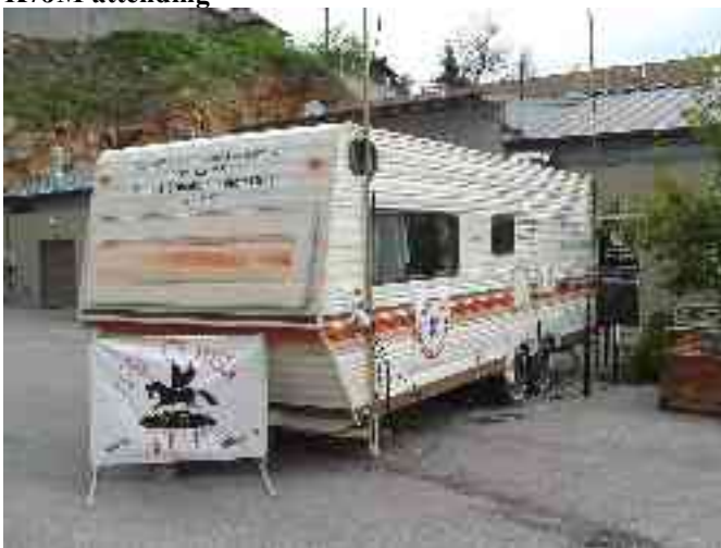
The MCU at Governor's Cup