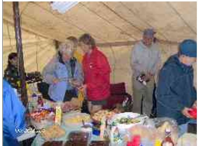
MMMM MMMM, What a spread