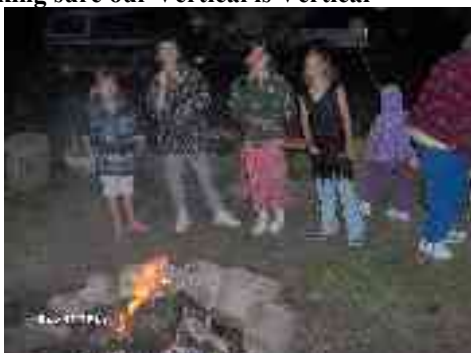
Field Day fun around the camp fire