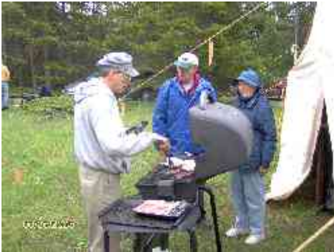
Hot BBQ ready at Field Day