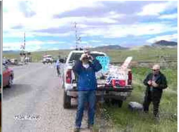
Governor's Cup at Bird's Eye Crossing