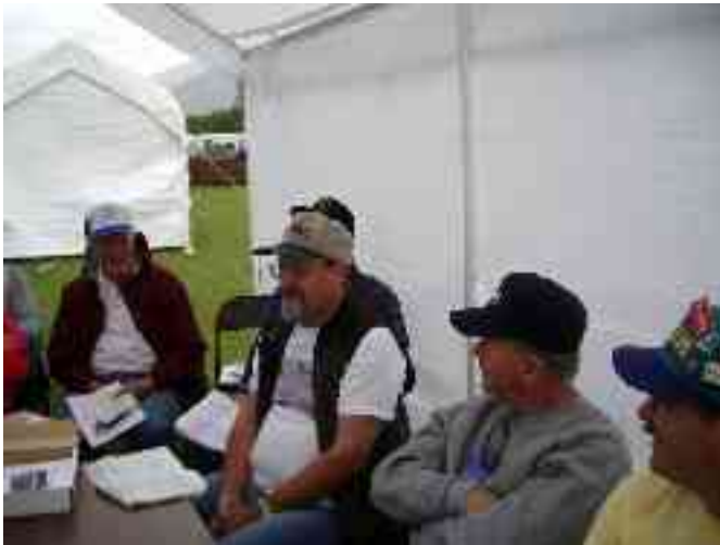
Glacier Waterton Hamfest QRP Seminar with WU7R and K7JM attending