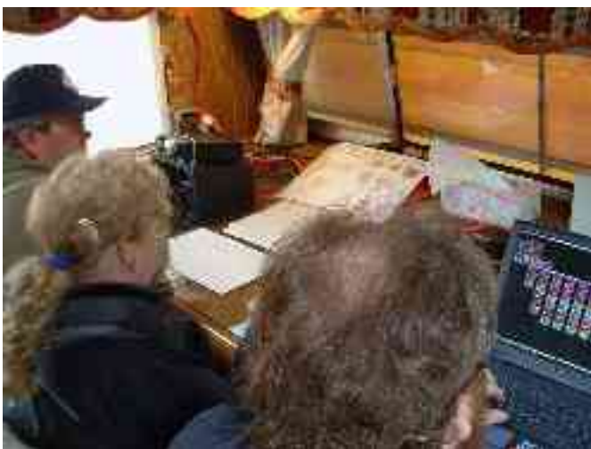
Governor's Cup operations inside the MCU