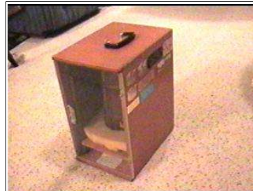
The Case made by VE5YK in 1988