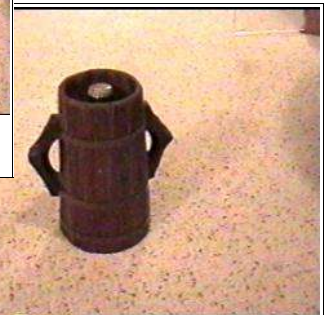
The Stein housing the bottle