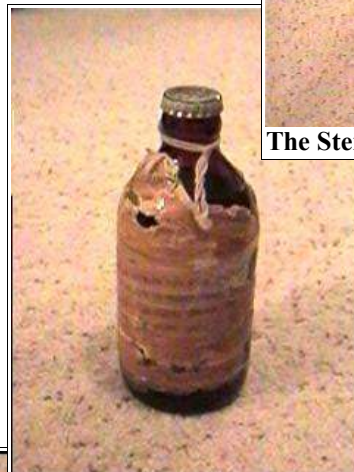
The bottle itself with attach RadioGram