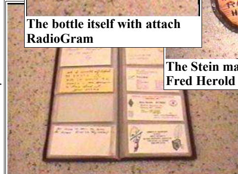
Mementos from some of the past owners (including Helena's W7MRI)