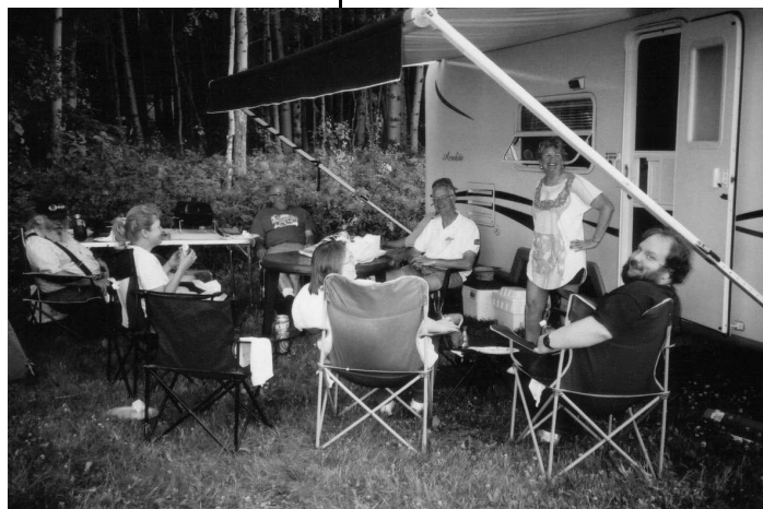
Some of CCARC's finest enjoying the cool of the evening at the Glacier-Waterton Hamfest.

Hamfest has been one of the main highlights of my summer for the past few years. It is a great place to rekindle those old acquaintances and make some new ones. There is always plenty of treasures to be gotten from the numerous "Tail-gate" sales,