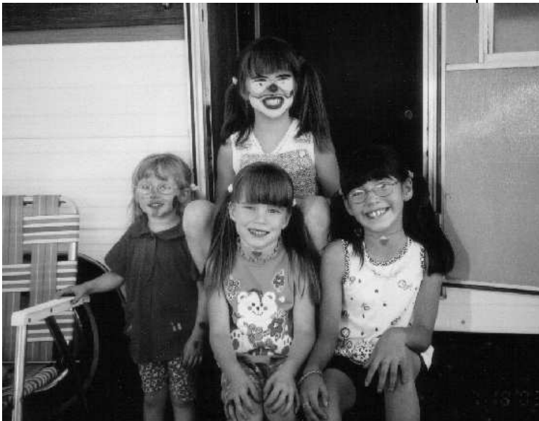
Something for everyone at Glacier-Waterton Hamfest including face painting for the kids.